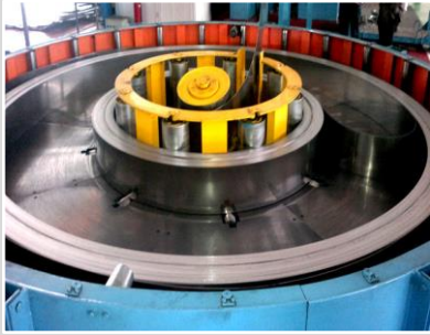
Tabletop Accumulator for tube sizes of < \phi 76\text{mm}